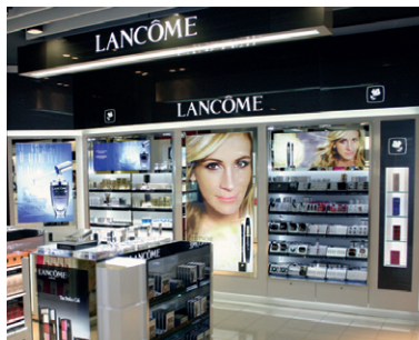
Lancôme corners, worldwide