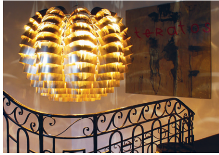
Luminaries in private house (F)