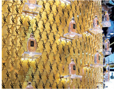
P.O.S. Yves Saint Laurent worldwide