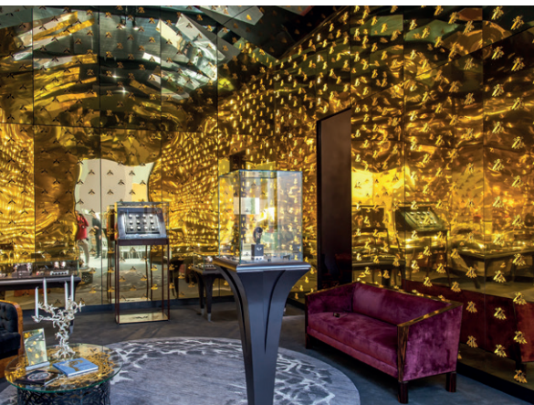
Jean-Charles Rochoux Chocolate shop, Tokyo (J)