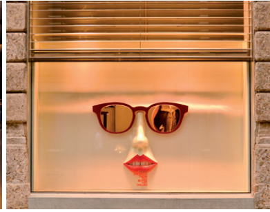
Excelsior, Milan (I), arch. Jean Nouvel