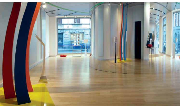
Allianz Tower, Milan (I), arch. A. Isozaki